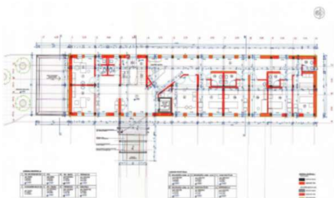
Slika 5. Glavni projekat rekonstrukcije i dogradnje postojećeg objekta za potrebe Odjela dječije i adolescentne psihijatrije -Tlocrt sprata