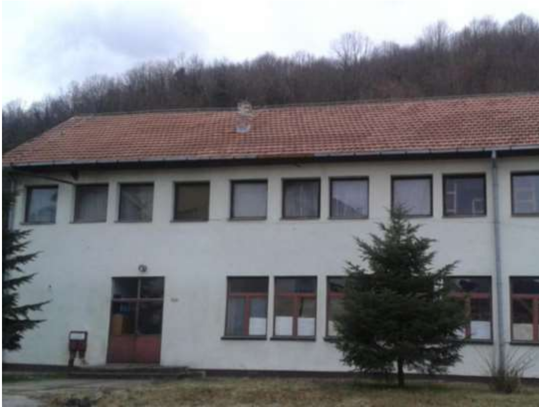
Picture 1. Current appearance of the building for reconstruction in Child and adolescent psychiatry department